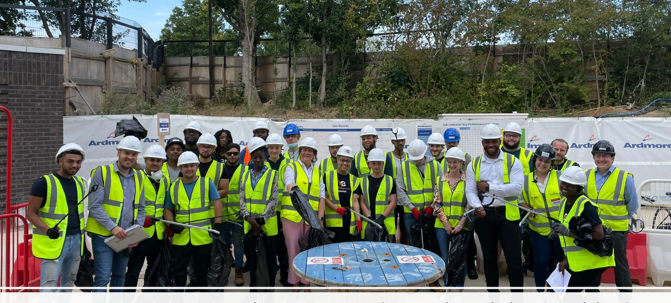
Become a Diversity Champion and Social Mobility Enabler?