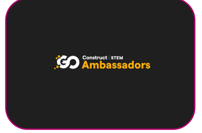
Go Construct STEM Ambassadors